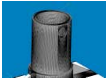
Excessively Fine Faceting