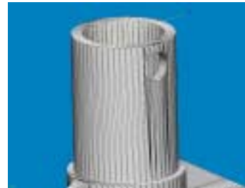
Good Quality Faceting

Coarse Faceting: In the image to the left above, you can see how coarse the faceting is. Instead of a nice round boss, the curve almost resembles a stop sign. What will happen with this file is the feature will build a little small on the outer diameter, and a little small on the inner diameter, because the laser will cure the resin in the planes that are defined by the straight lines. Coarse faceting is almost always caused by the Angle setting being too high, or the deviation/chord height settings being too large, or a combination of both.